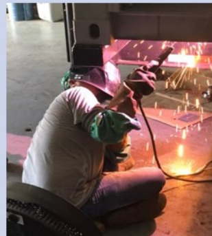
MT-1000 Fire Trainer Modifications

◇ Government Office Upgrades Space Planning, New High Technology Conference Rooms & Furniture, SCIF Security Wall Installations